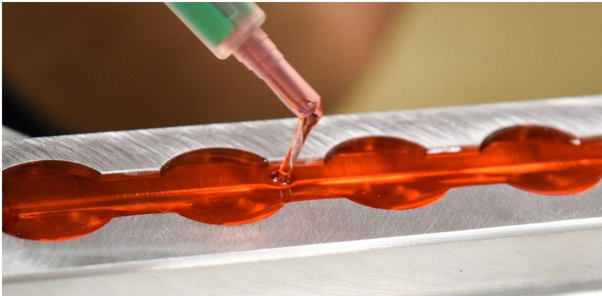
Self-Leveling ® Red being installed in seat track.

Av-DEC's ® two component polyurethane material is designed for use as a watertight, flexible sealant. The low viscosity allows for easy application where self-leveling is desirable. The system demonstrates excellent adhesion to itself (cohesion) and allows for easy removal when necessary. Similar to HT3326-5 Self Leveling Green, with expanded storage temperature and application temperature ranges, as well as consistent gel time across a wide temperature range. This product is also available in flame retardant (FR).